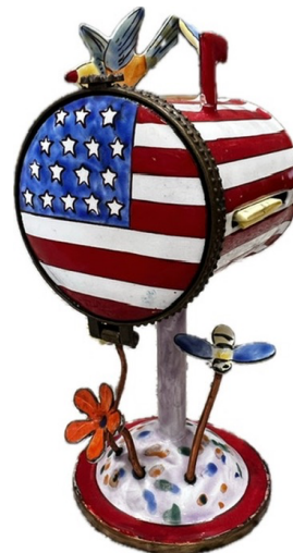
Cloisonne 4 th of July mailbox