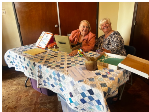
Selling tickets at the door. Look at those beautiful smiles! Terrific Greeters!