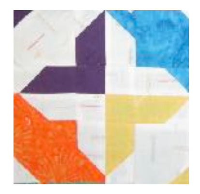
This unit x 4