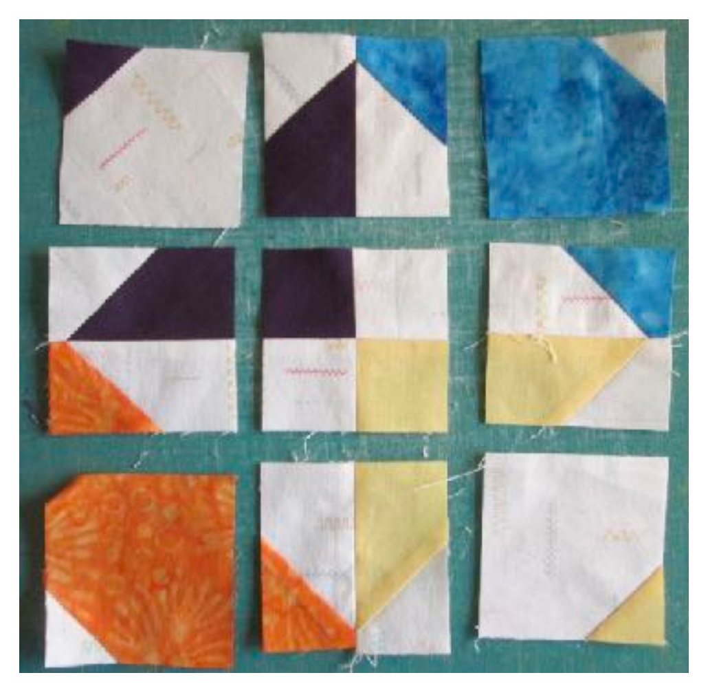
Step 5 Now for the layout. To make a single 12" finished block, arrange the 4 units so that the center is a either a <u>dark</u>, a <u>light</u>, or <u>mixed</u> Octofoil (also called a Double Quatrefoil). (See below). Sew together as a 4-patch

Turn the corner squares 180 degrees. These are the only ones that move. Sew pieces together as a 9-patch. It should measure about 6.5 inches. Repeat Steps 1-4 to make 4 units.