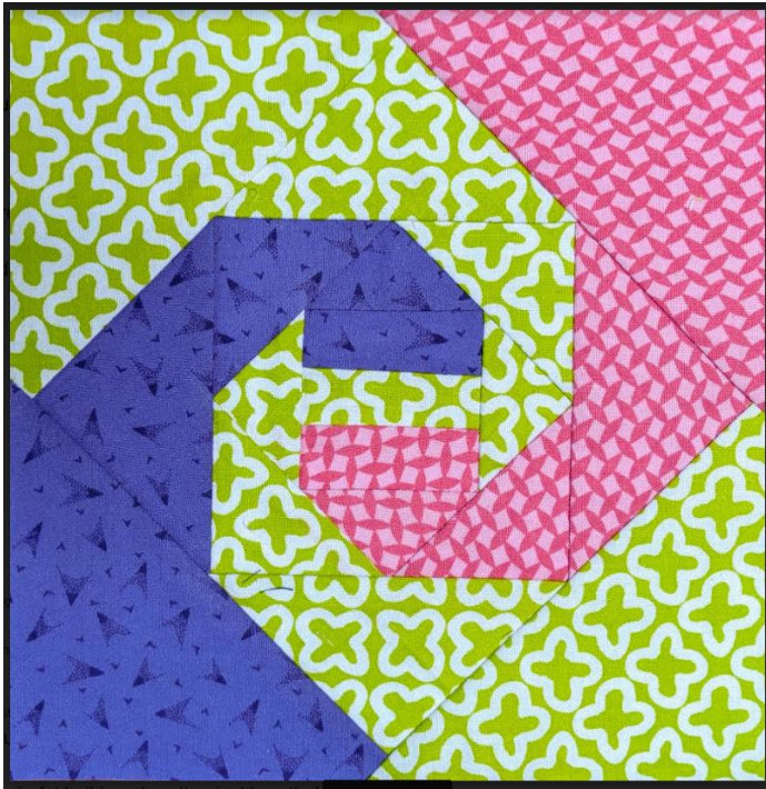
January BOM 2022