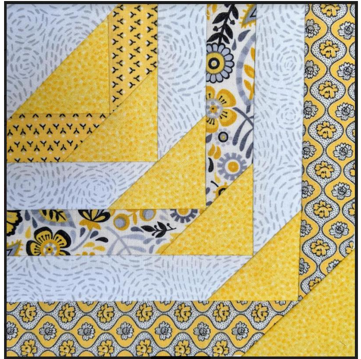
February BOM 2022