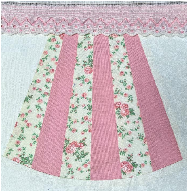
November BOM 2021