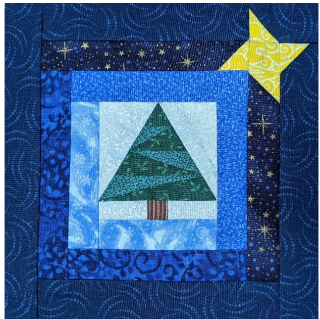
"House in the Pines"