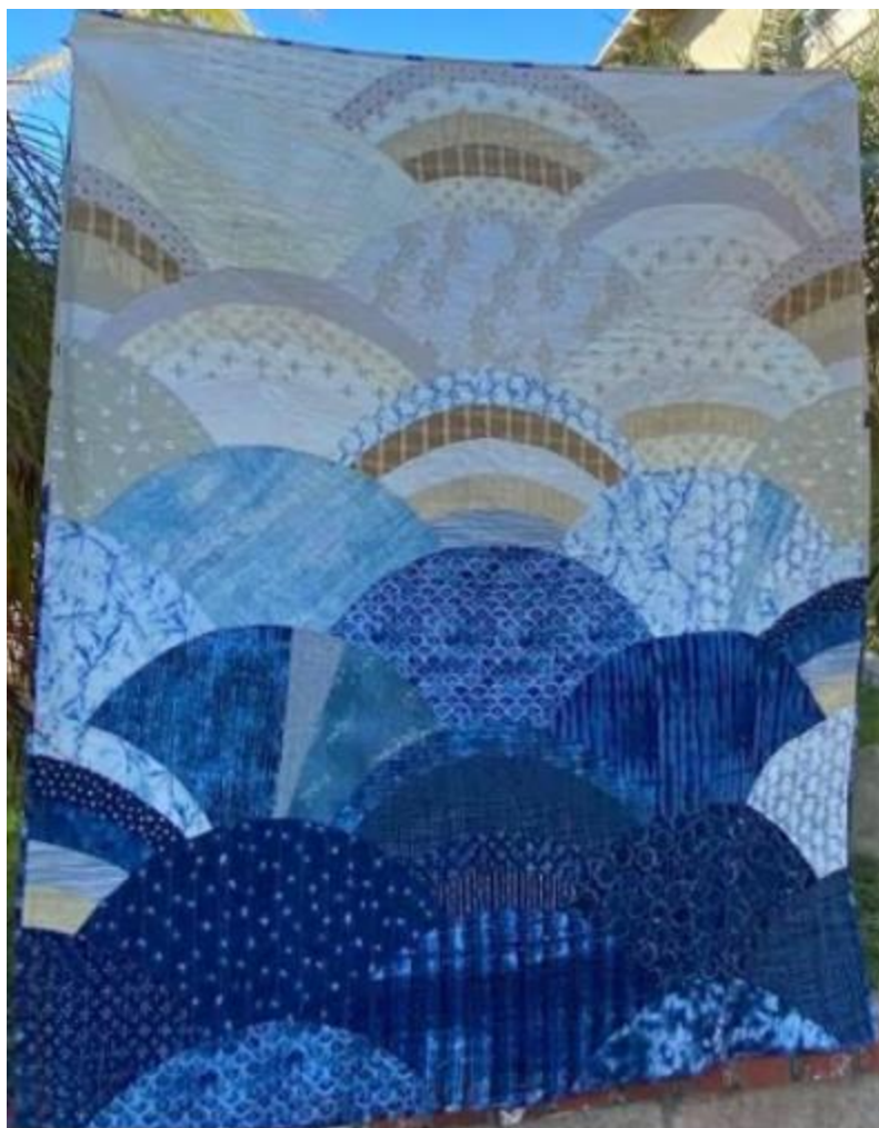
Indigo & Cream Mole Hills