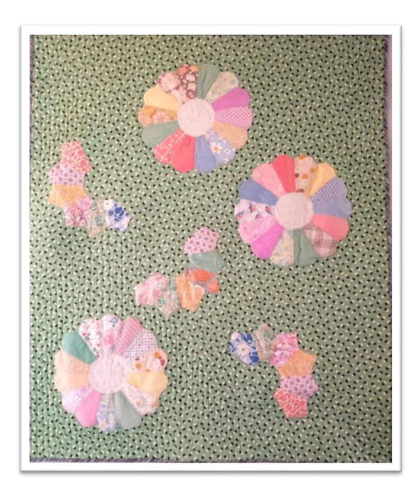
"Grandma's Plates" by Kim Froedge