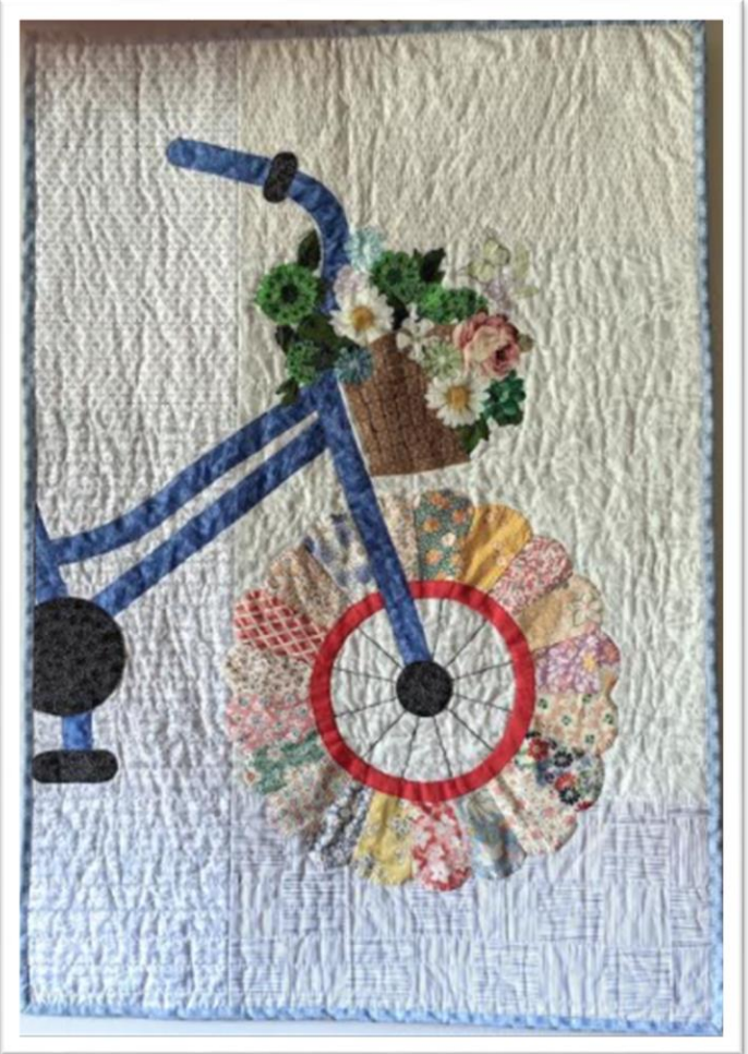
"Dresden Made Modern" By Lynne Woods