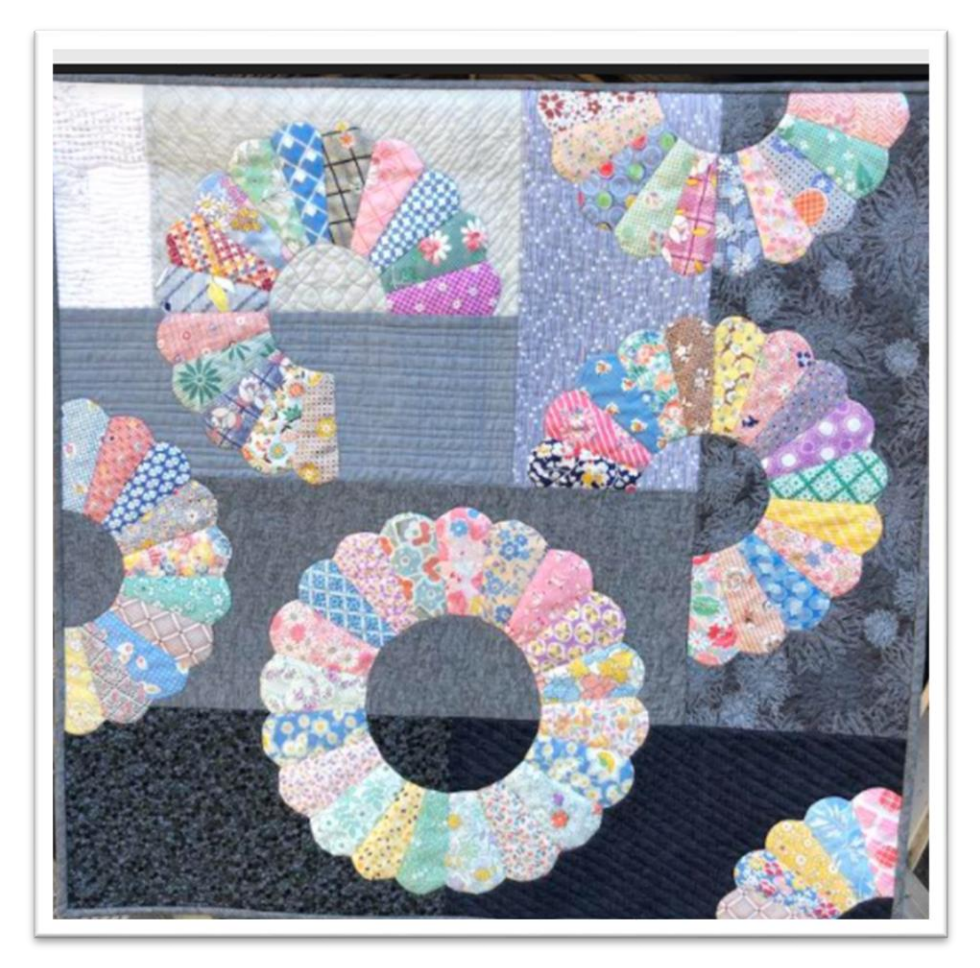
"The Value of Dresden Plates" by Jane Aiello