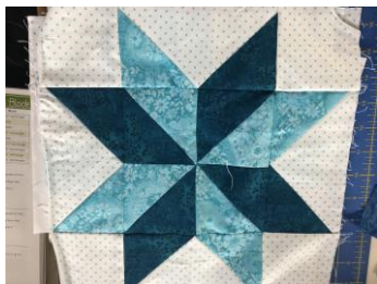
November- Sarah's Choice