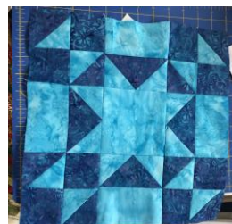
January- Amish Star

Happy New Year Camarillo quilters! I'm wishing you a prosperous new year filled with many completed UFO's. Remember they may be worth money, making a star quilt is a start!