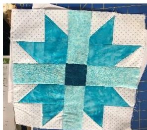
December - Star Crossed