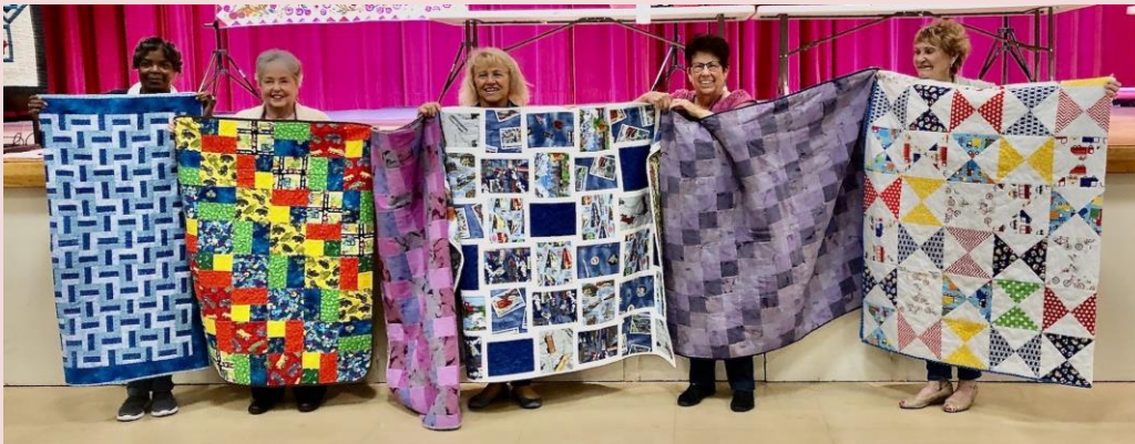
The Seaside Stitchers' presentation of quilts in November

(Your chances of winning are based solely on the number of event tickets sold.)