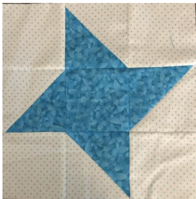
July Friendship Star